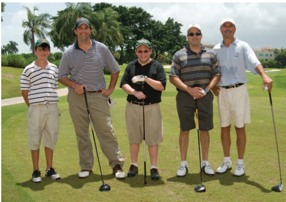
Pictured above: The winners of the tournament – Team Ischemia.

Anticipation is already building for the Sixth Annual SNIS Golf Tournament to be held on Tuesday, July 27 at the La Costa Resort & Spa in Carlsbad, California. Start practicing now...you could be our next winner!